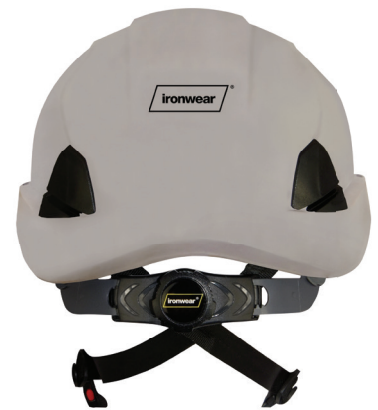
(Back with Ratchet)