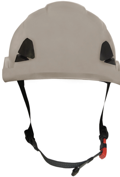
(Front with Chin Strap)